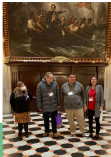
Right/Top: Advocate participates in assistive technology demonstration Right/Bottom: Advocates stand in front of "Perry's Victory on Lake Erie" in the Ohio Statehouse

Advocates also mentioned better accessibility in public areas, better transportation, and the Direct Support Professional shortage. All are important for supporting independent living.