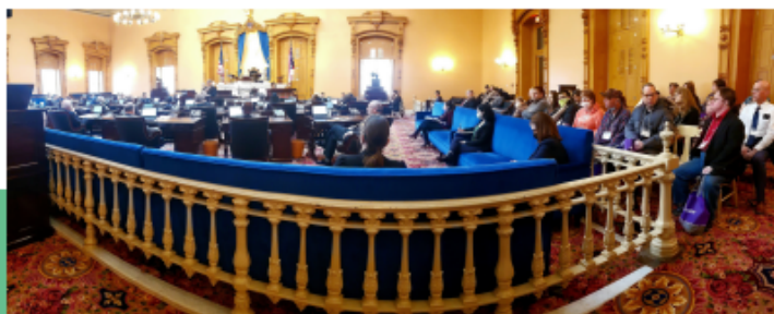
Left/Top: Screenshot from the Ohio Channel broadcast Left/Bottom: Advocates observe in the Senate Hearing Room