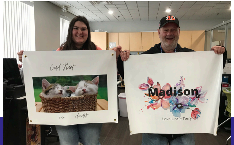
CCBDD coordinated with Champaign County Library to create a Technology Club. In this club, individuals served by the County Board and other community members come together to use the Imagine Lab and learn new technology skills.