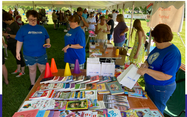
Kiwanis Aktion Club is the only service club for adults with disabilities. The Champaign County Aktion Club builds and maintains Little Free Libraries around the county, provides free books to children at YMCA Healthy Kids Day, assembles and distributes sensory bags for first responders to use during emergency calls, and much more.