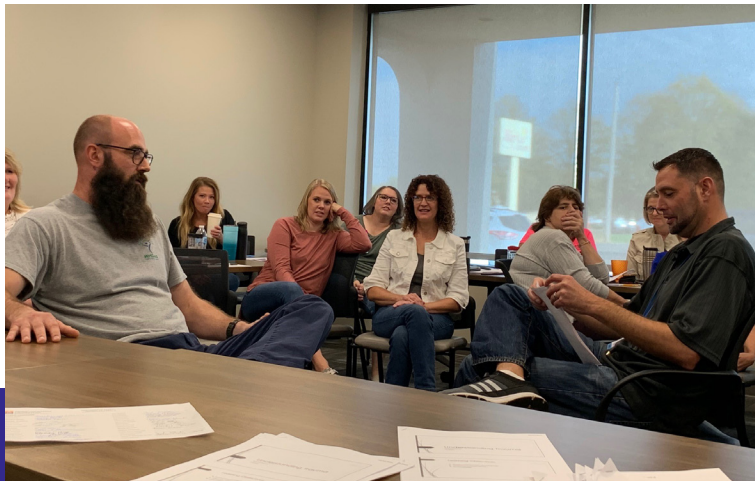
Mental Health, Drug, & Alcohol Services Board joined a CCBDD in-service meeting to present information on trauma informed care. They also shared ideas with CCBDD on how to incorporate trauma informed care with current processes and evaluations.

The work of Champaign County Board of DD would not be what it is today without the help of all the community partners. These collaborations help people with developmental disabilities live independently, socialize, work, volunteer, and celebrate the abilities that make them an integral part of the Champaign County community.