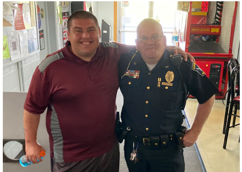
First Responders Lunch is an opportunity for individuals with developmental disabilities and emergency personnel to form positive relationships. First Responders also benefit by learning best practices for safe interactions with community members who have differing abilities.

Even more collaboration happens between CCBDD and county